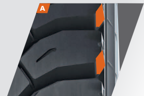
Rounded tread block profile to reduce tread tearing.