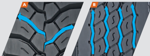
Optimised groove pattern.