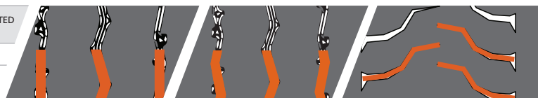
X ® WORKS ™ Z IN 315/80 R22.5